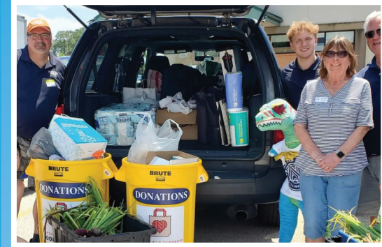
Picking up Food Pantry donations at Northbrook Farmers Market