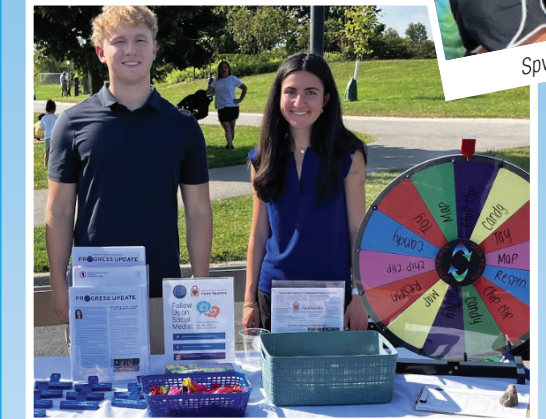
Interns staff Township table at the D34 Resource Fair