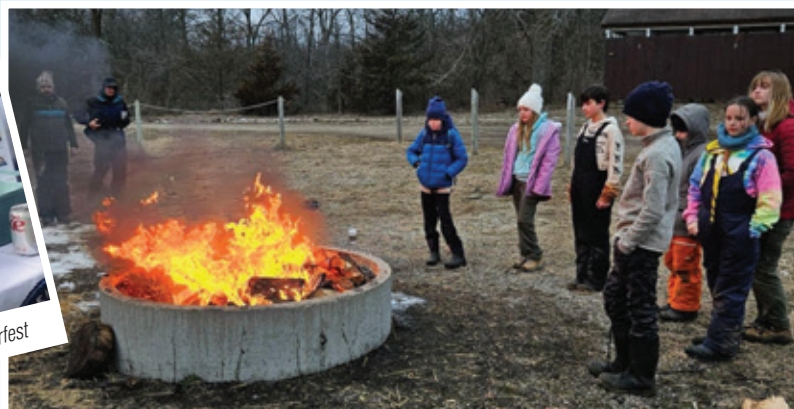
Road District cleans and burns brush for area residents