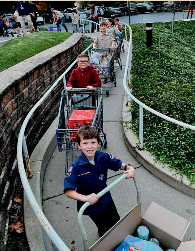
Cub Scouts Pack 156 help unload busloads of food from the "Stuff the Bus" event held in conjunction with the Character Counts Food Drive sponsored by School Districts 30 & 34.

Pantry clients can now make same-day appointments, an option often requested since we returned to in-person shopping. We have also begun composting unusable produce. And we reunited with Costco for weekly pick-ups of food that the retailer generously donates. We're working with more local restaurants including Peet's Coffee too.