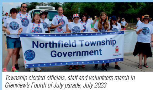
Township elected officials, staff and volunteers march in Glenview's Fourth of July parade, July 2023