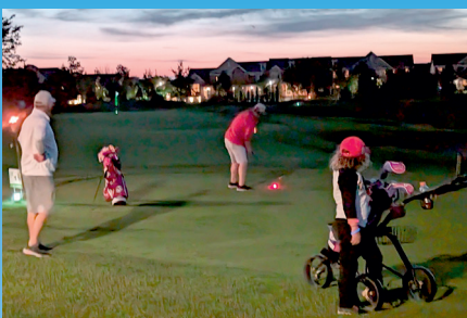
Golfers enjoyed a fantastic evening of glow-in-the-dark golf at "Glow Fore It," a fundraiser for the Northfield Township Food Pantry, September 2023